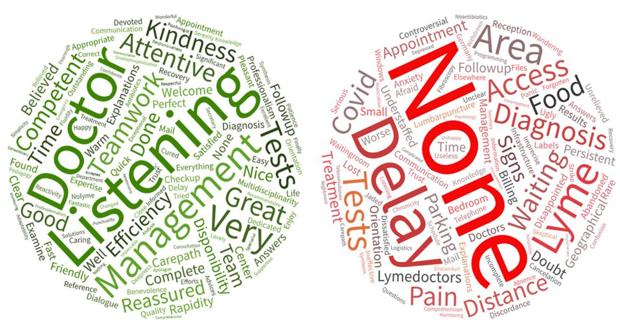
Fig. 1 Word cloud describing positive and negative aspects of the TBD-RC of Paris and the Northern Region from patients' perspective

the staff and encouraged benevolence: "The physician took the time to listen to me and to understand my personal history." Second, this dedicated time improved the quality of the patient-doctor relationship based on shared medical decisions and shared information: "The doctor believed me. He took me seriously." and "I had a good contact. I was able to ask my questions, and I had clear answers." Multidisciplinarity enabled coming up with different solutions to the same health problem, which broadened the medical options for the patients: "I received great advice adapted to my case and positive comments." However, a few patients found that they had received too much information. The medical synthesis given at the end of the day had helped them read the information again and understand it at their own pace. On the contrary, 10 patients "went back home with their questions" because they were overwhelmed by the number of experts they had seen in one day. They didn't dare to ask their questions, and therefore the answers did not appear in their synthesis. Finally, this dedicated time appeared to have a positive impact on the patients' quality of life: "It changed my life all throughout my care-paths at the TBD-RC and even now" and "I felt supported and did not suffer anymore from medical wandering." The participants had a good opinion about this survey, which demonstrated the doctors' "concern for patients' physical and mental well-being."