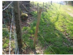
Figure 1: Correct fences 2 - external fence at least 1.3 m high + internal fencing with several superimposed electric wires.